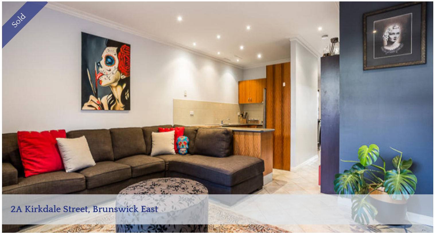
2A Kirkdale Street, Brunswick East